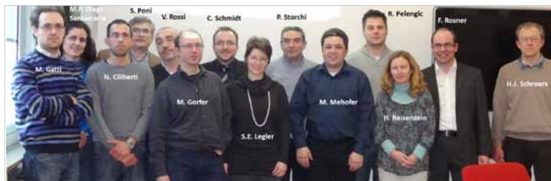
Project partners at the Kick-off meeting, held in Piacenza (Italy) in January 2012.

The authors thank all the participants to the project for their contribution to the article.